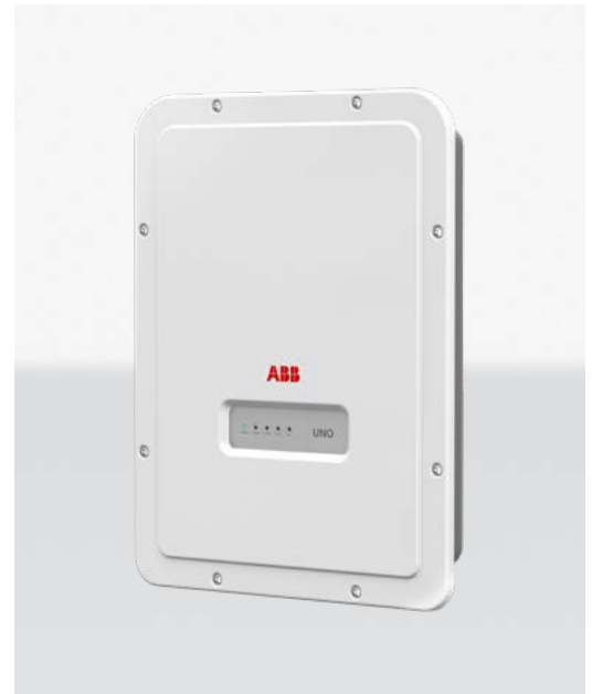
ABB string inverters UNO-DM-1.2/2.0/3.0-TL-PLUS-Q 1.2 to 3.0 kW