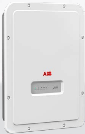
— UNO-DM-TL-PLUS-Q outdoor string inverter

UNO-DM-1.2/2.0/3.0-TL-PLUS-Q 1.2 to 3.0 kW